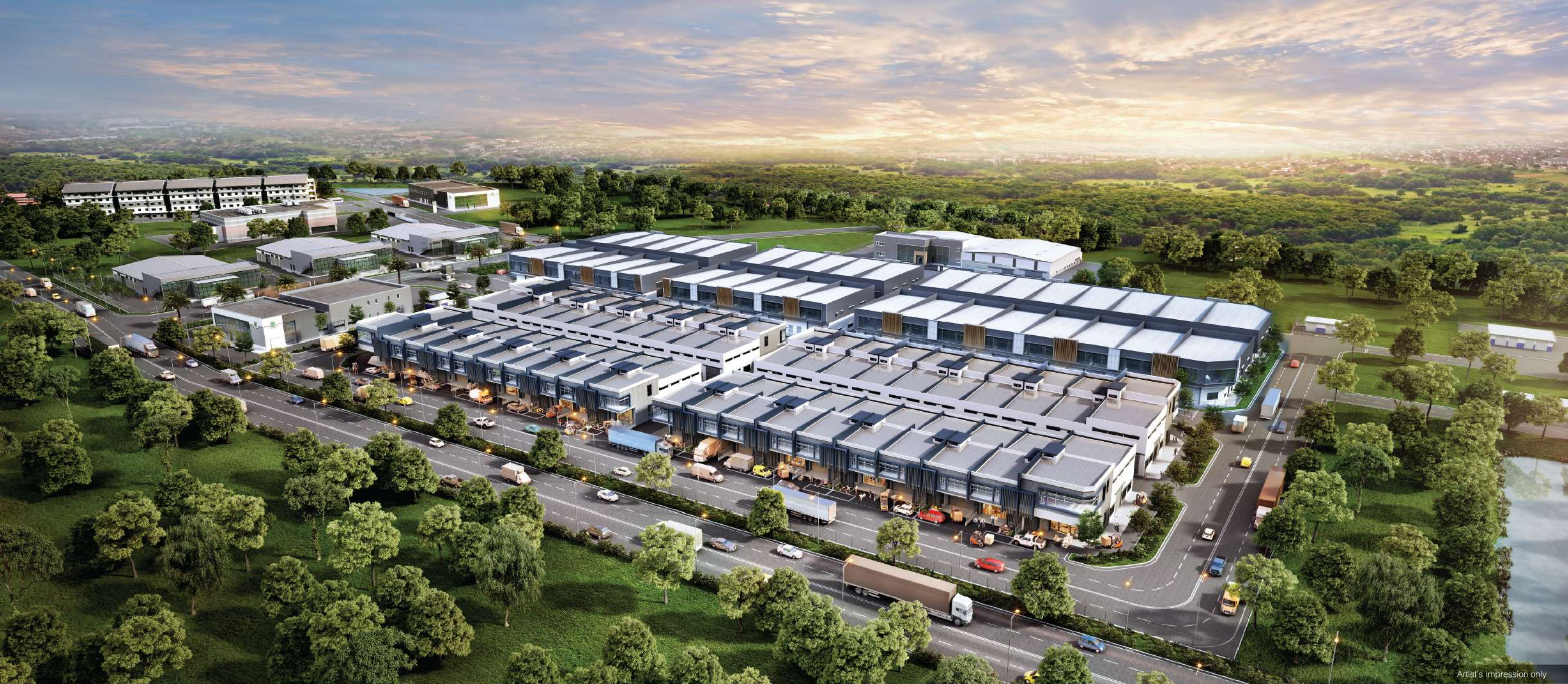
Artist's impression only