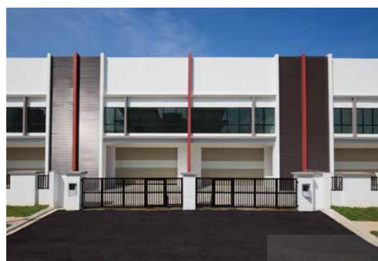
Artist's Impression of Senibong 88

And as a result, the most attractive segment in Iskandar's property market today is actually in industrial property. We feel really proud as we have already obtained certificate of completion and compliance for our project of Senibong 88 and our next project is going to be Desa 88 and Pengerang Avenue.