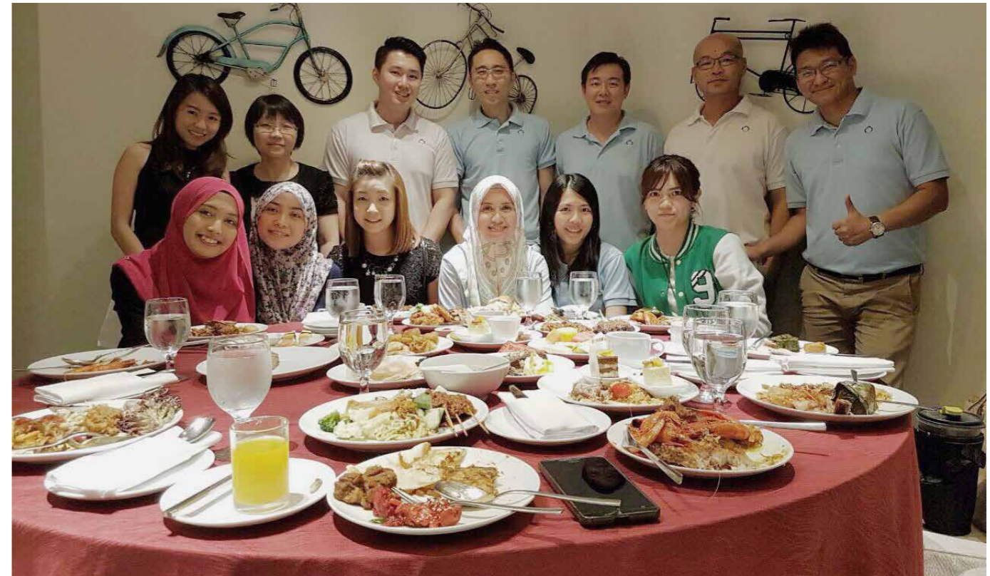
17th June 2016 in Renaissance Hotel