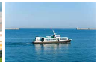
Pulau Tekong Ferry Terminal