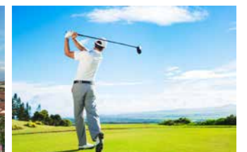
Desaru Golf & Country Club