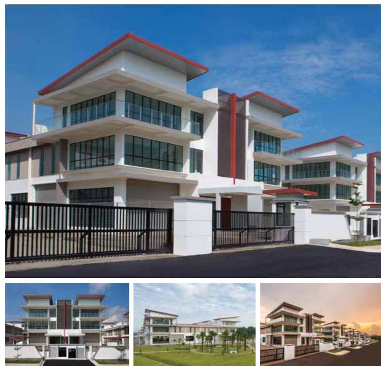
Facade Outlook of Senibong 88

Much of the media attention in Iskandar Malaysia has been on its thriving manufacturing segment. The renowned growth region has achieved more than RM 161 billion of cumulative committed investments as of Q1 2015, 31% in manufacturing which is also the segment that has achieved the highest investments in total, higher than that in residential property.