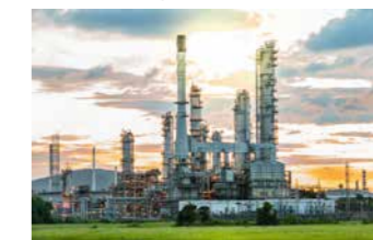
Pengerang Integrated Petroleum Complex (PIPC)